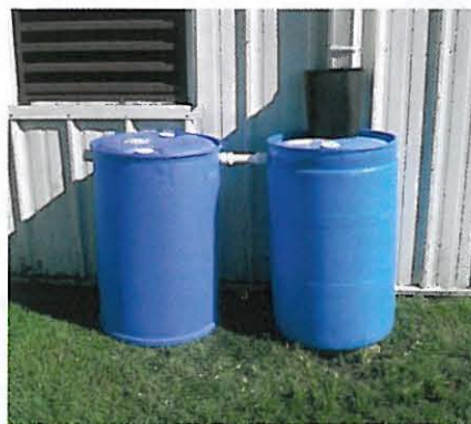
Reharvesting rainwater can be used to flush toilets, do laundry or water gardens.

Facilities can also save money by reducing material costs because they use smaller diameter piping and do not require vent stacks. They can be installed vertically or horizontally and therefore offer flexibility in designing or renovating facilities. The Salinas Valley State Prison (SVSP)