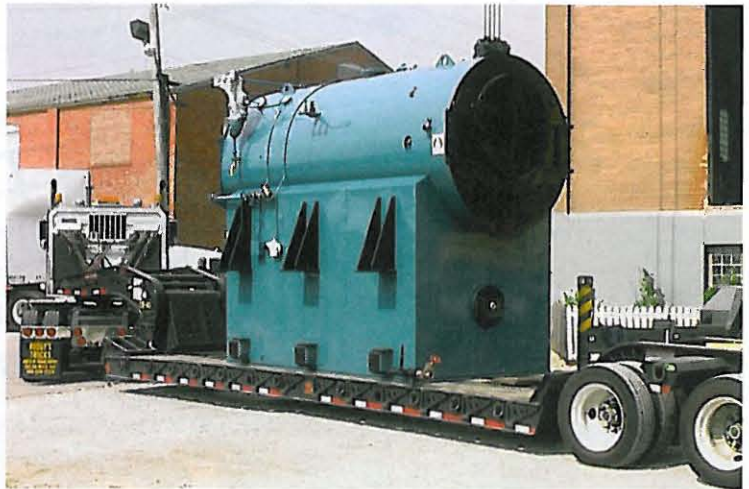
Biomass boiler used by Indiana's Putnamville DOC facility that burns bio-products such as switch grass, bark, sawdust and wood chips.

From use of biomass boilers to lower heating bills to collecting AC condensation to conserve water, here are some sustainable steps employed by forward-thinking corrections agencies.